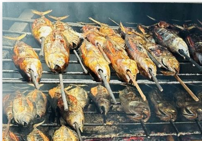
Freshly smoked catch from the Dobo Smoked Fish group, showcasing traditional smoking methods for exceptional flavour

In addition, partnerships have allowed products from Eltimo Food and the salted fish from Balobo Star and Longgar Jaya to reach markets in Jakarta from Merauke and Aru through Nizzam Food vendors. Feedback from an e-commerce platform highlighted that the salted fish lived up to its description, being both tasty and tender, exactly as advertised.