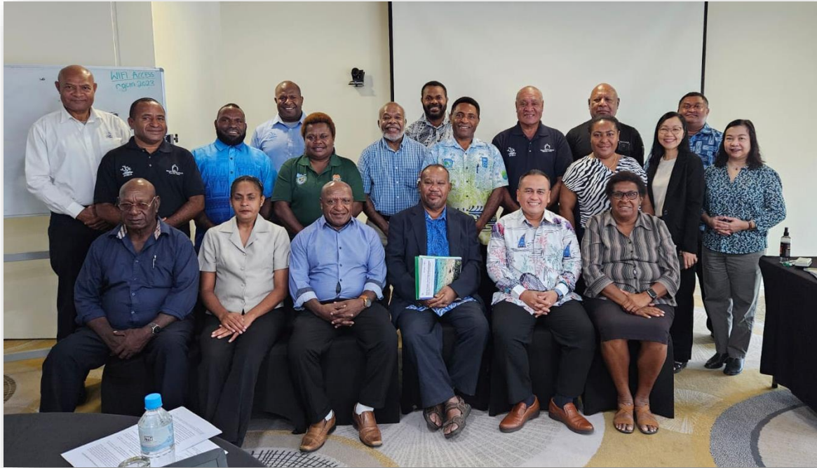
Participants at the Strategic Action Programme (SAP) and National Action Programme (NAP) in Papua New Guinea