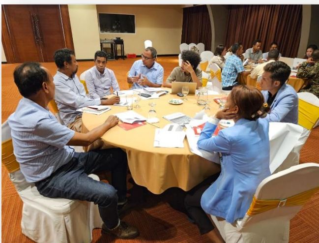
Workshop participants in Timor-Leste discuss ideas in a group session

These discussions are critical to the broader aim of formalising the SAP, NAPs, RGM and their financing plans for implementation through a Ministerial Declaration to be signed at the Ministerial Forum in Timor-Leste in August 2024. This momentous occasion will mark the beginning of the transition from the donor-supported ATSEA-2 project to a sustainable regional governance mechanism, dedicated to realising the shared vision of "A healthy, resilient, and productive ATS that supports human wellbeing and nature," and ensuring the long-term conservation and productivity of the Arafura and Timor Seas.