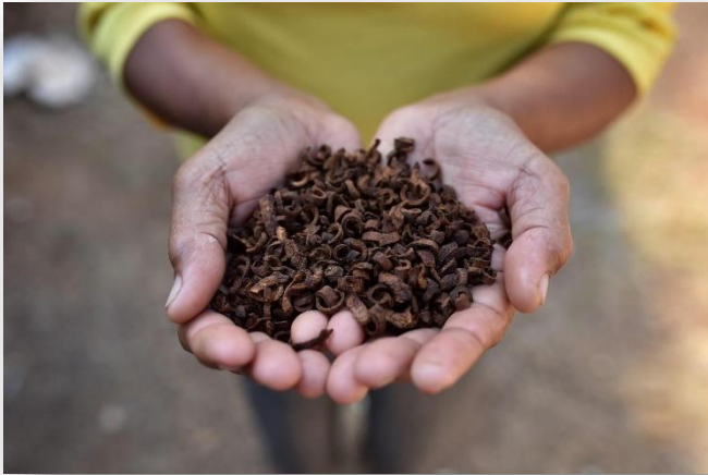
Mangrove seeds ready to be ground

The collaboration between Mama Novi and Om Steven represents a powerful model of community leadership that marries economic innovation with environmental conservation. Their collective efforts not only showcase the economic value of mangroves but also underscore the critical role of community-led environmental protection. The ATSEA-2 project supports Daiama Village by providing training, facilitating dialogues with government bodies, and promoting alternative livelihoods, ensuring the longevity and impact of the village's conservation work. This approach illustrates the project's commitment to empowering communities for sustainable futures.