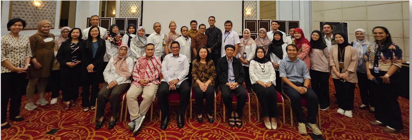
Enthusiastic attendees at the Strategic Action Programme (SAP) and National Action Programme (NAP) Mainstreaming Workshop in Indonesia

In the first quarter of 2024, the ATSEA-2 Project held a series of national consultation workshops which aimed to promote the mainstreaming of key actions in the updated 10-year Strategic Action Programme (SAP) for the Arafura and Timor Seas (ATS), and supporting National Action Programmes (NAPs), into the work and budget frameworks of the countries and strategic partners in the region. SAP and NAP Mainstreaming Workshops were held in Dili, Timor-Leste on 1 February 2024, in Port Moresby, Papua New Guinea on 5 February 2024 and in Bogor, Indonesia on 29 February 2024.