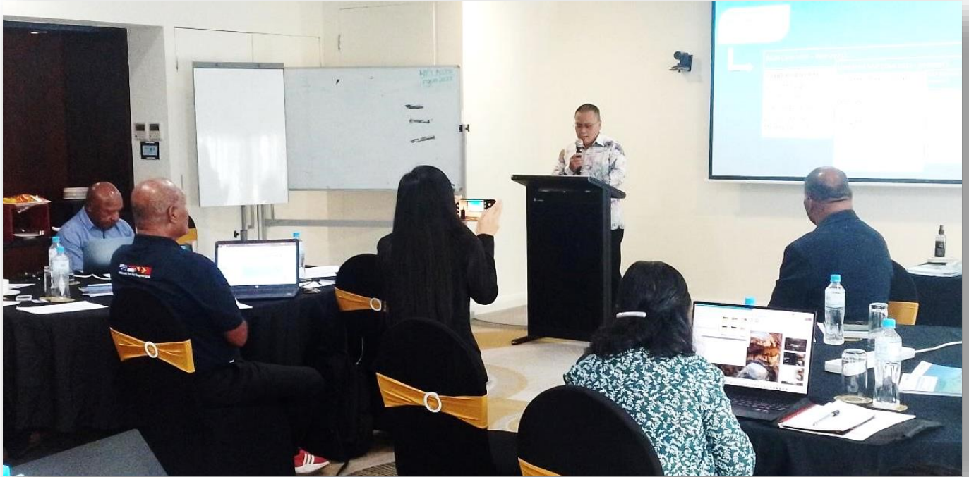
Strategic Action Programme (SAP) and National Action Programme (NAP) mainstreaming workshop with relevant state agencies in Port Moresby, Papua New Guinea

The ATSEA-2 Project has been instrumental in fostering collaboration among countries adjacent to the Arafura and Timor Seas (ATS), addressing transboundary environmental and fisheries issues. This initiative has facilitated significant achievements in information exchange and capacity building, enriching both regional and national conservation efforts.