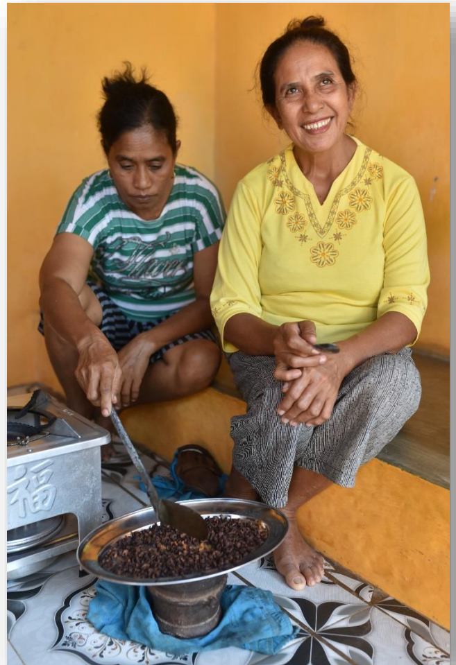
Roasting dried mangrove seeds with traditional methods in Rote Ndao

Daiama Village's transition showcases the significant impact of empowering local communities through conservation. By accessing essential resources and fostering open dialogue, Daiama exemplifies effective community-led action in achieving sustainable environmental outcomes, ensuring the mangroves' longevity and the community's prosperity.