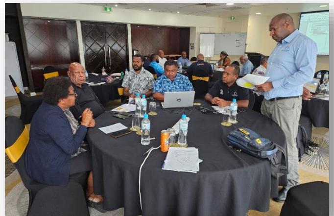
Workshop Participants in Papua New Guinea actively engages in discussions

The opening of the workshop in Timor-Leste was also graced by H.E. Mr. Marcus da Cruz, the Minister of MALFF. "The Government of Timor-Leste has laid out its priorities and the challenges we face. It is our expectation that government partners will internalise these priorities within our government programs for joint implementation. This includes a focus on marine biodiversity conservation, marine tourism, and other areas crucial to the Strategic Action Programme (SAP) and National Action Programmes (NAP) for ATSEA."